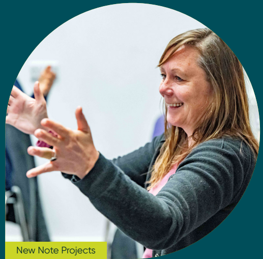
New Note Projects

We are one of the Flexible Funders, signing up to IVAR's eight funder commitments*, to fund charities in an open and trusting way. The eight commitments were designed by charities and funders to support the management of grants and relationships in a way that reflects funders' confidence in and respect for, the organisations they fund.