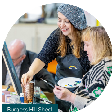
Burgess Hill Shed

For every £1 invested in fundraising, we raised £25