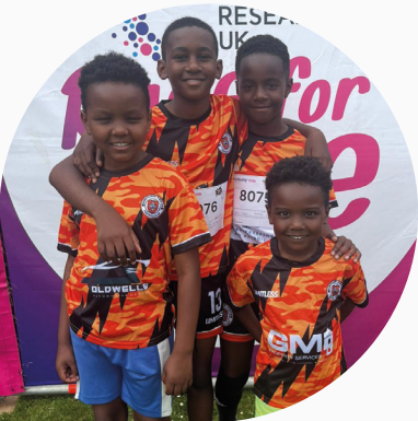
Limitless Youth Football Club

TC Group Chartered Accountants Registered Auditors One Bell lane Lewes East Sussex BN7 1JU